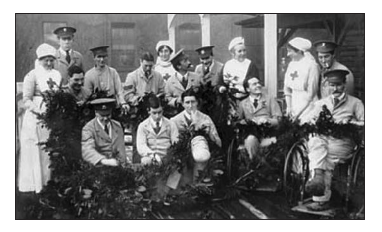
[Women in warfare in the early 20th century]