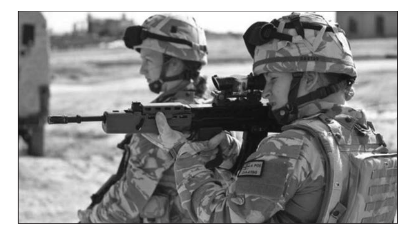
[Women in warfare in the 21st century]